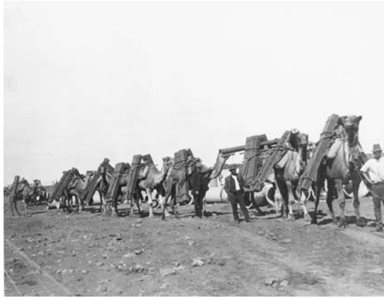
Figure 3: Camel trains used to carry supplies including well timbers and sleepers for construction of the Trans-Australian Railways, between 1914–17.

transactions required intermediate negotiations with people—camel owners, foreign government, customs officials. And the animals themselves demanded significantly more attention, which Americans familiar only with such northern species as horses and cattle were ill equipped to provide. (In consequence a Syrian handler named Hadji Ali—soon anglicized to “Hi Jolly”—was hired to accompany the first shipment of camels.) A total of seventy-five camels survived their ocean voyages and their subsequent treks to army posts throughout the Southwest.