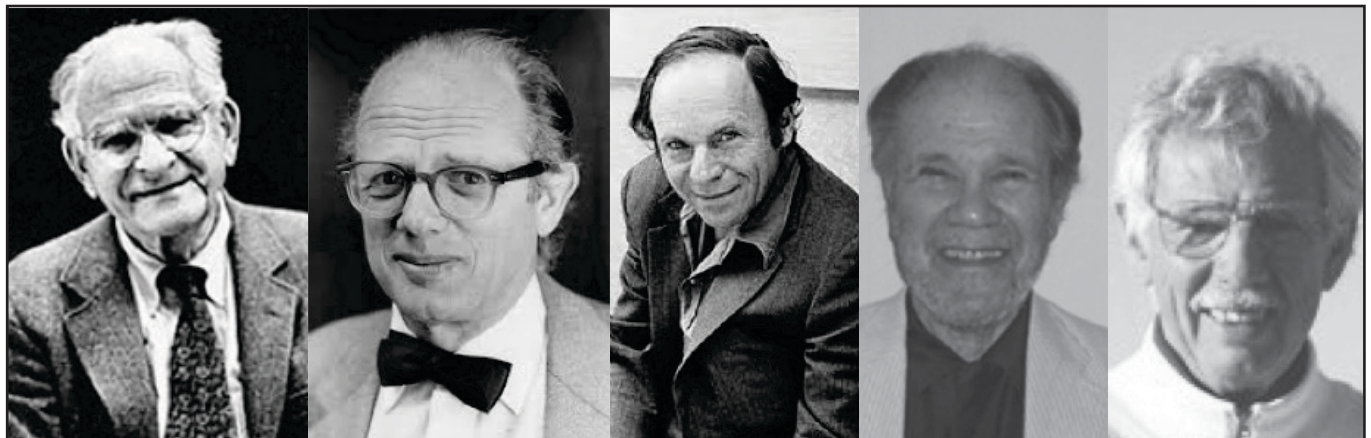
Members of the MIT Physics Department 1969

Why was MIT the locus of the scientists' strike? The MIT Physics Department faculty had a long history of opposition to nuclear weapons. The scientific leaders of the Department were also leaders of the nuclear disarmament movement . . . .