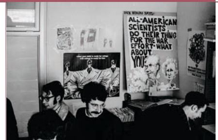
1969 Science Action Coordinating Committee Office

in this issue we offer commentary on MIT's new outside funder review process (Editorial, below) and a related Open Letter to the MIT Corporation (page 5); a remembrance of the March 4, 1969 Scientists Strike for Peace and MIT's essential role (below); the results of the recent FNL Editorial Board election (page 4); and "Progress Towards an Improved First-Year Undergraduate Experience" (page 10).