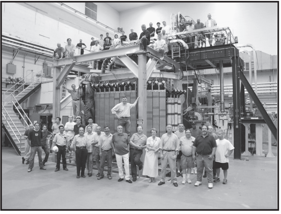
Members of the BLAST collaboration at the detector in the Bates South Hall

particular focus is understanding the distribution of spin in the deuteron