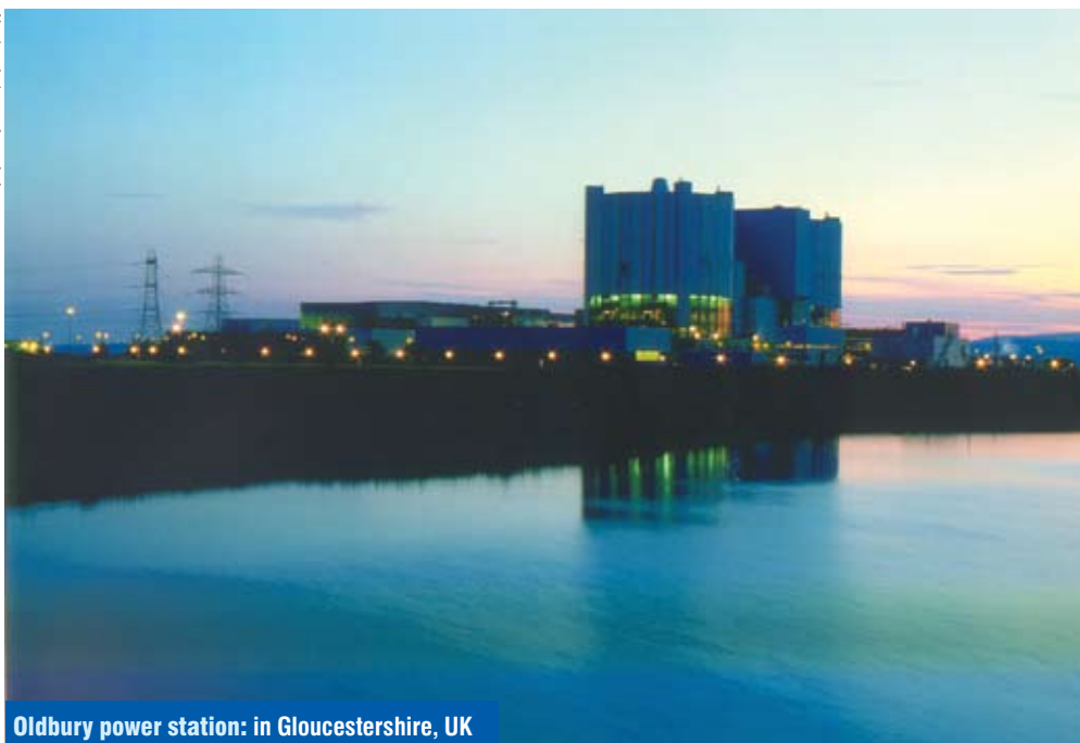
Oldbury power station: in Gloucestershire, UK