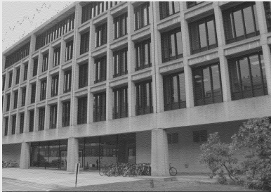
b2: Building 13