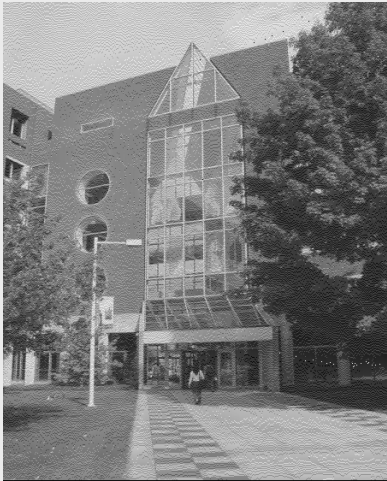
b1: Medical Center