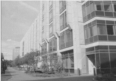
a1: biology building