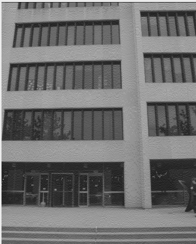
c1: Building 9